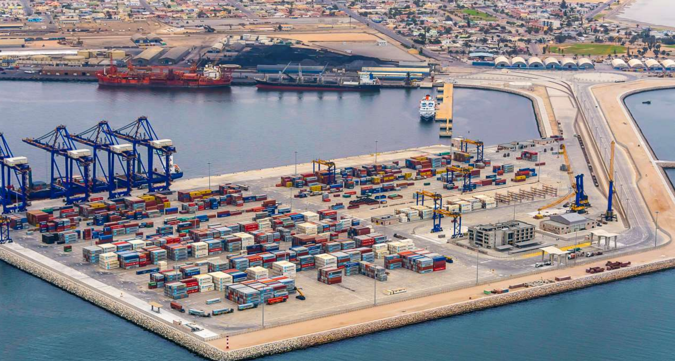
NEW CONTAINER TERMINAL AT THE PORT OF WALVIS BAY