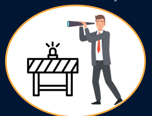
Redirecting chain to navigate blockages is still of variable impact