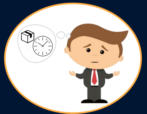
Forecasting cargo arrival time still of variable consistency