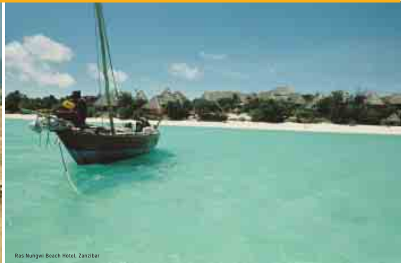
Ras Nungwi Beach Hotel, Zanzibar