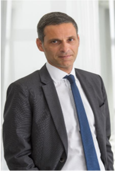
Rodolphe Saadé, Chairman & CEO of the CMA CGM Group