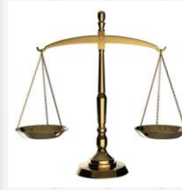
Load sensing system