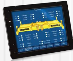
Predicting spreader issues with AI