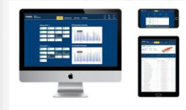
Spreader Monitoring System