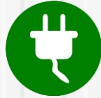
First all- electric spreader