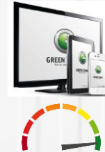
Green Zone for productivity