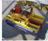
First tandem spreader