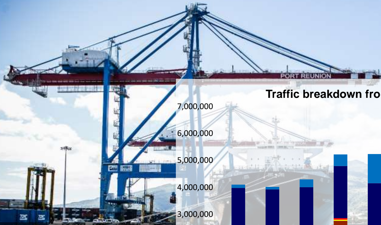
Traffic breakdown from 2011 to 2020 (tons)