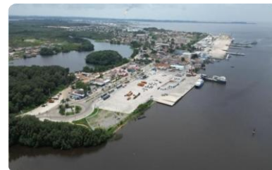
Soyo — New Terminal Long-term concession for passenger terminal.