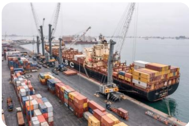
Luanda — Extension 20 + 10 Years starting October 2027.