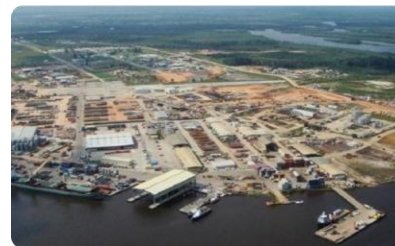
Cabinda — New Terminal Strategic multi-purpose concession for general cargo.