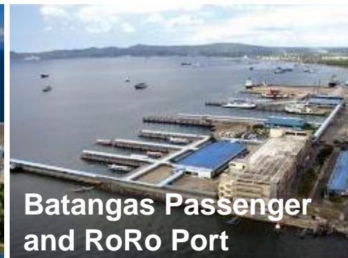
Batangas Passenger and RoRo Port