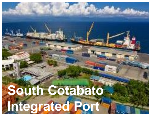
South Cotabato Integrated Port