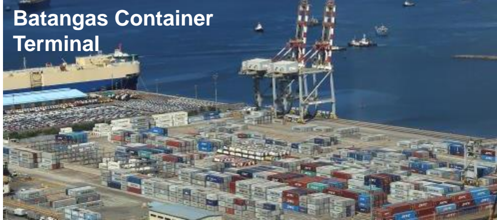
Batangas Container Terminal

ATI offers comprehensive and competitive port services for containerized, non-containerized, bulk & break bulk, and passengers – a synergy of services and expertise for the Philippine Supply Chain.