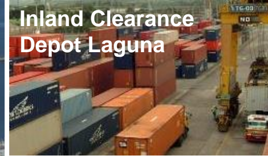
Inland Clearance Depot Laguna