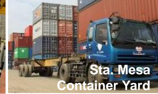
Sta. Mesa Container Yard