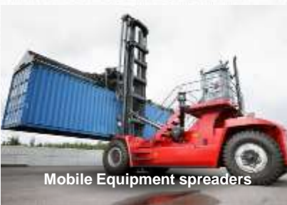
Mobile Equipment spreaders