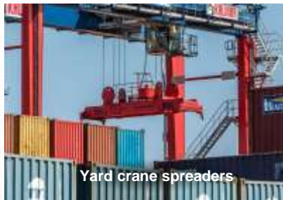
Yard crane spreaders