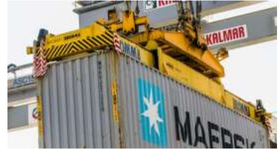
Use of spreaders