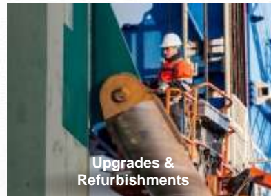
Upgrades & Refurbishments