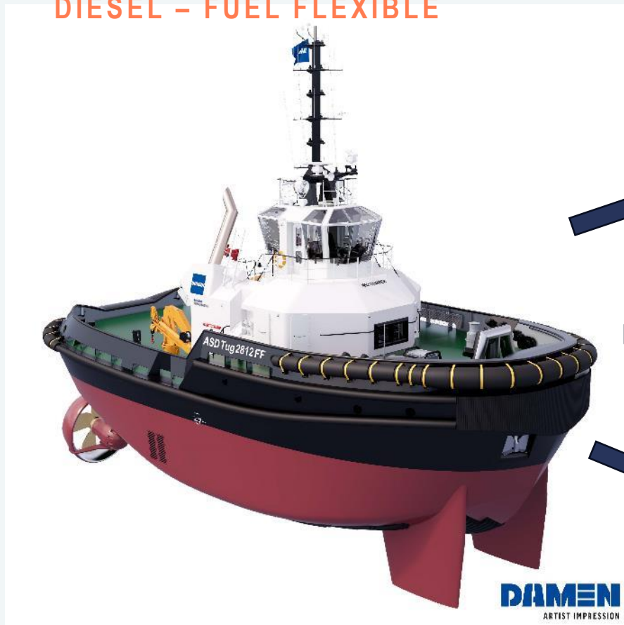
DIESEL – FUEL FLEXIBLE