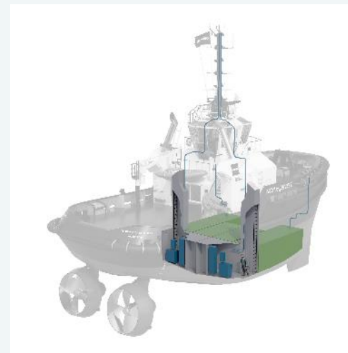
DIESEL – METHANOL